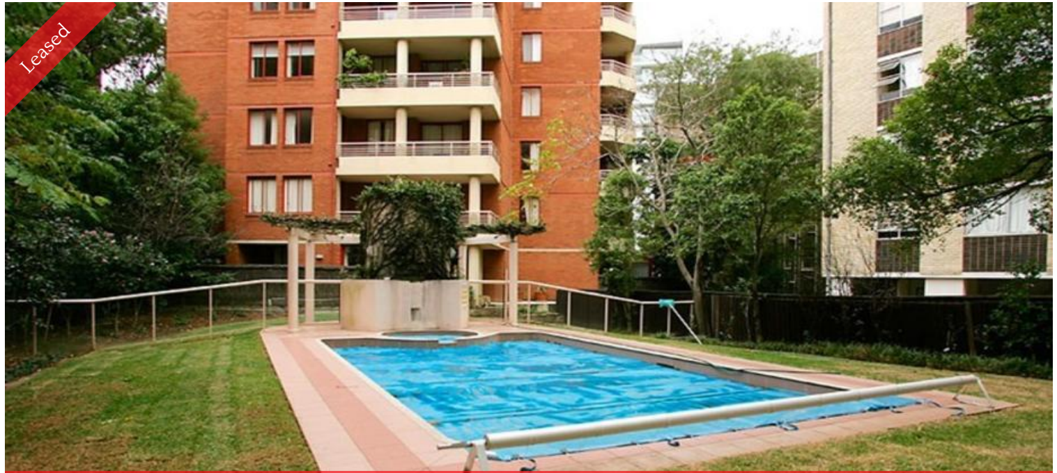
Unit 706, 2-6 Birtley Pl, Elizabeth Bay