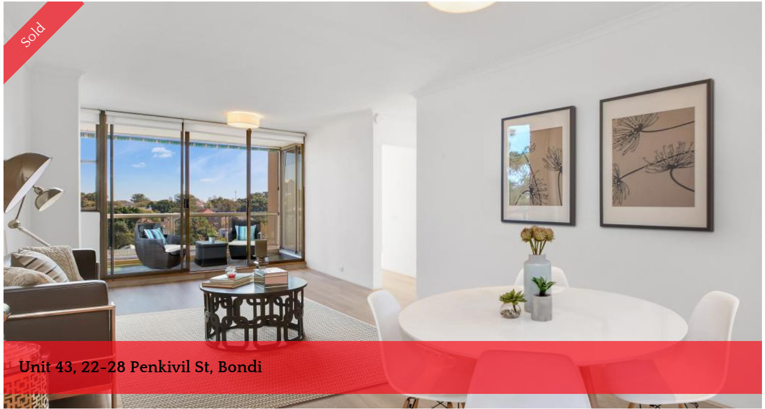
Unit 43, 22-28 Penkivil St, Bondi